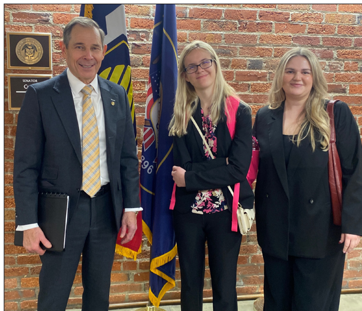
The 2025 TCPA team from Utah poses with Utah Senator Mike Curtis.