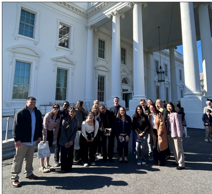
TCPA 2025 outside the White House.

The program also included a tour of the White House. While teams learned about the history of the White House, the tour also reiterated the idea of bipartisanship, which the TCPA program emphasizes. Regardless of who is president, the White House and the administration play an important role in our government’s history and policymaking, and this was a unique opportunity to learn about it firsthand.