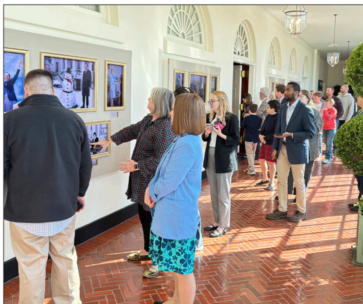
Teams from TCPA tour the East Wing of the White House.