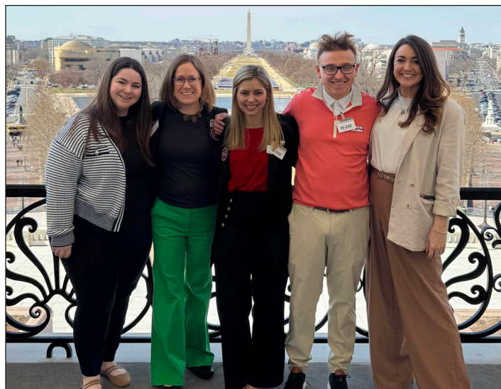
TCPA staff stand with the team from Louisiana on the Speaker’s Balcony of the US Capitol Building in March 2025.

The final day in Washington was spent visiting legislators on Capitol Hill. Participants were prepared for how and why to do this throughout the TCPA training. Students and coaches learned about current and pending legislation that might impact postsecondary education and students with intellectual disability, how to state their thoughts and perspectives on these issues, and the differences between educating and lobbying when speaking to federal legislators and sharing their personal experiences.