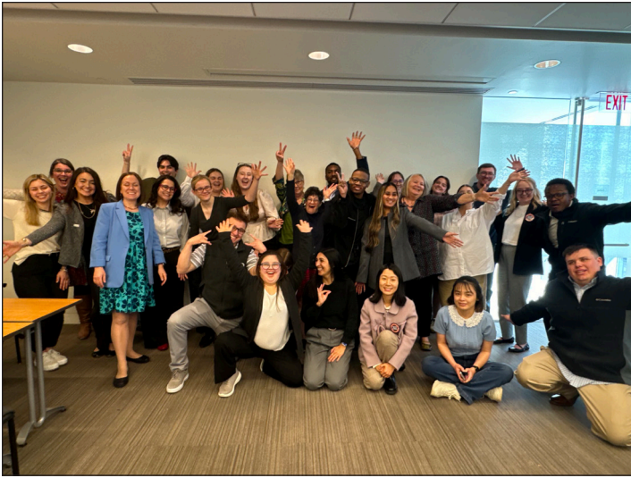
Group shot of the 2025 Think College Policy Advocates at the Microsoft Innovation office.